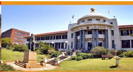
HOWARD COLLEGE CAMPUS