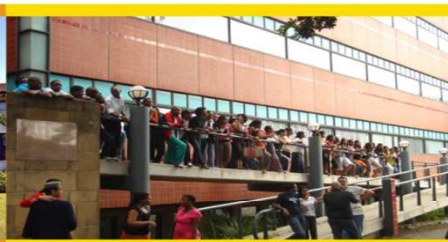
NELSON R MANDELA SCHOOL OF MEDICINE