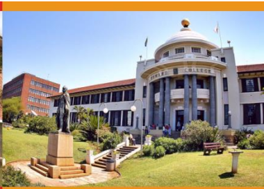
HOWARD COLLEGE CAMPUS