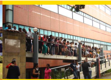
NELSON R MANDELA SCHOOL OF MEDICINE